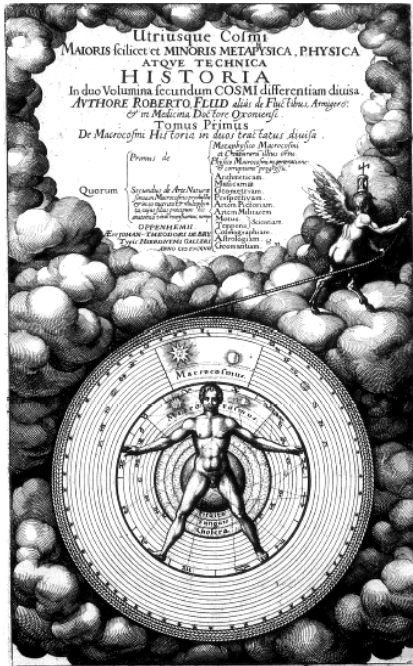
(a) Cover Page of Fludd's Utriusque